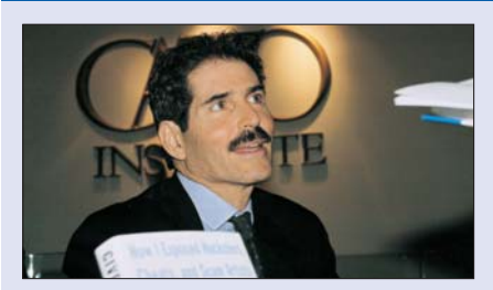
Stossel in New York and D.C., p. 7